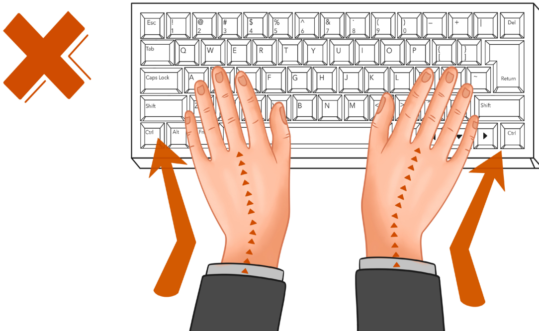
Figure 5.2.1: Ulnar Deviation

When using a normal keyboard, you may have noticed that there typically remains a gap between the width of your keyboard in relation to the width of your shoulders. To make up for that, you turn your wrists inward, increasing the risk of injury to your wrists. (See Figure: 5.2.1 Ulnar Deviation)